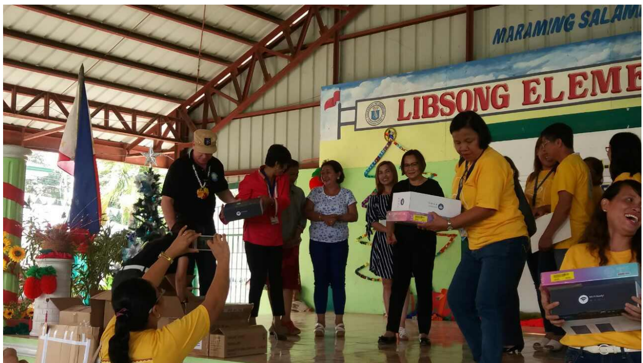
Christmas came early for the hard-working folks at Libsong Elementary this year.