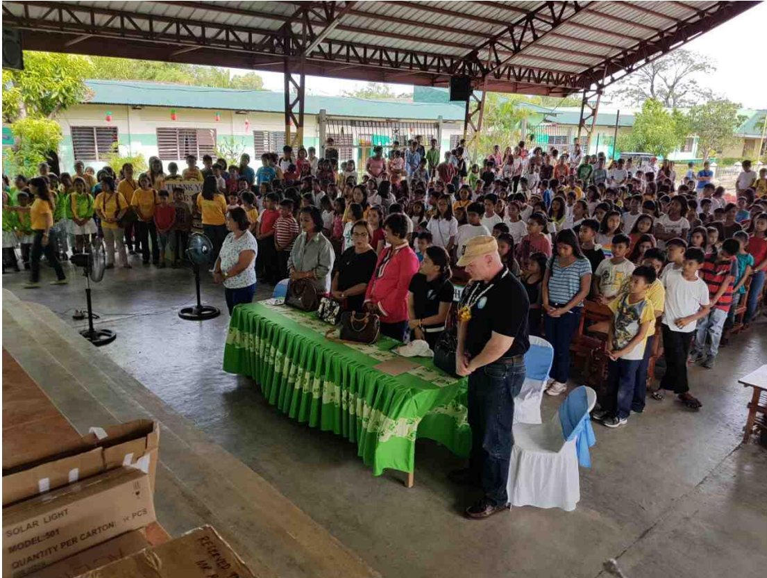
Invocation before the taking the stage to demonstrate the computers, projectors and solar lights.