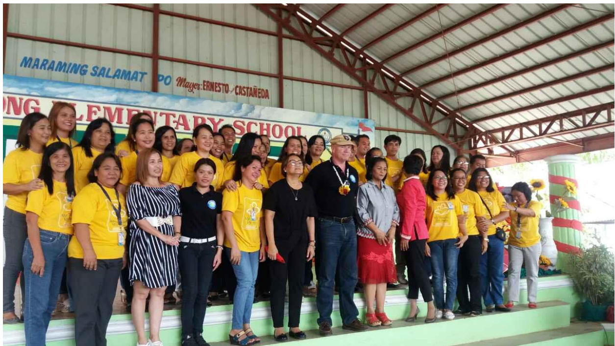
Mission completed, it's now time to enjoy lunch inside the Principal's office, where a huge tray of the world famous Pangasinan Bangus awaits 😊