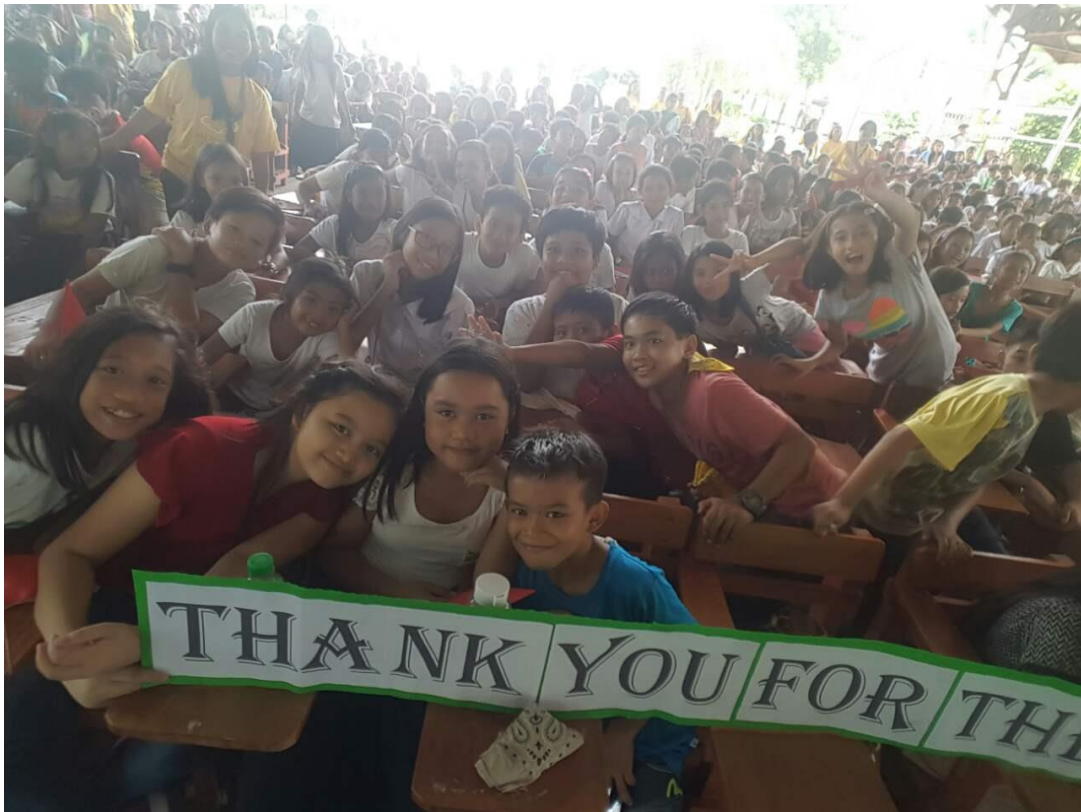
With over 1100 students and 36 classrooms, Libsong is one of the larger schools in the region.