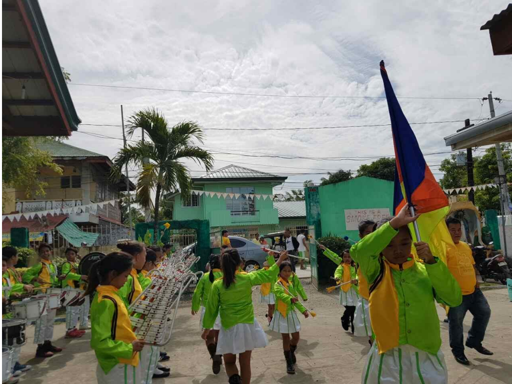
The school band and flag-bearers ushered us through the gates