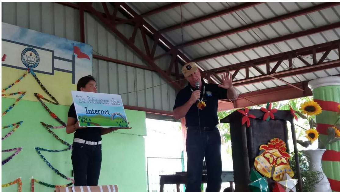
"Master English to Master the Internet, so you can Master your Future" is the central message.