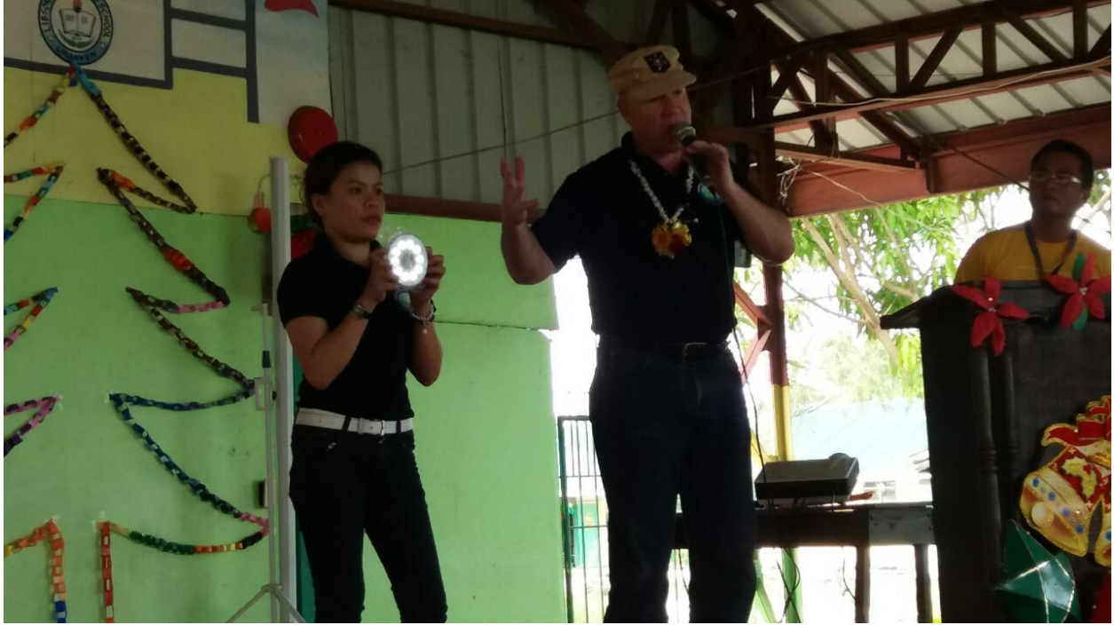
The HPSF Solar Lights provide illumination inside homes of poorer students where electricity either isn't available or sporadic, as well as after typhoons.