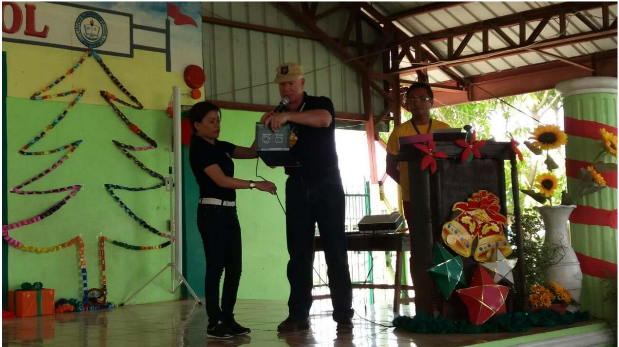
The UNIC Uc46 wireless projector is plug-and-play, easily installed, and displays hi-res visibility in any ambient light.