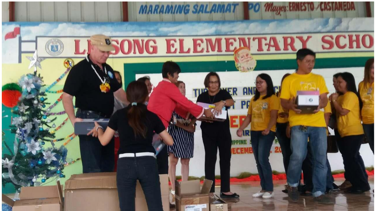
Presenting the computers and projectors to the teachers