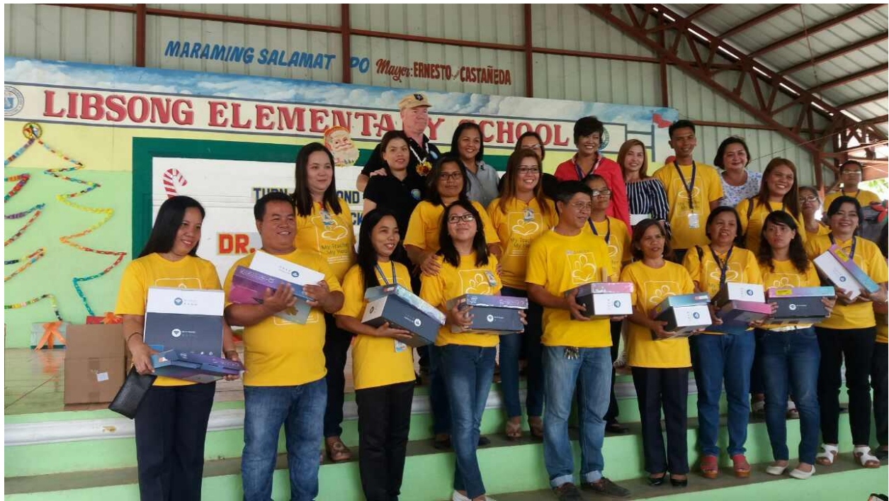
This brand new, state-of-the-art technology will help jump start the learning processes in the minds of both teachers and students.