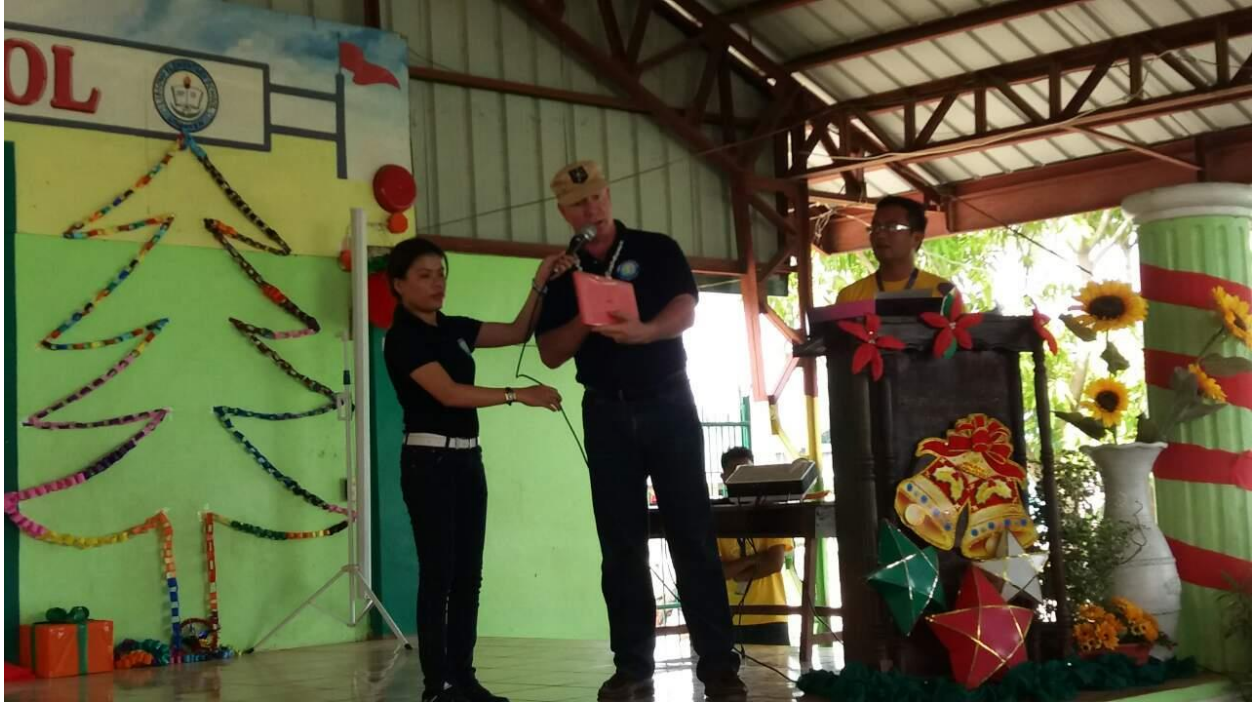
The Acer Switch 10 Laptop/Tablet is perfect for 4-6 grade instruction applications, as it allows both the teachers and students to interact together at the front of the classroom.